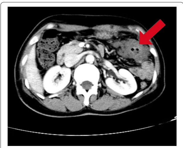
Fig. 3 Computer tomography image obtained from a 53-year-old female patient with a mucinous colorectal adenocarcinoma (5.5 \times 3.0 \times 2.5 \text{ cm}) located in the transverse colon 55 cm from the anus. No significant enhancement compared with normal muscle in the arterial phase was observed. The patient was diagnosed as mucinous colorectal adenocarcinoma staged T4N2M1 with liver and abdominal metastases. She received 3 cycles of XELOX (capecitabine plus oxaliplatin) chemotherapy, a palliative surgery, 5 cycles of XELOX chemotherapy, and capecitabine maintenance therapy for 5 months till present

Multiple clinical trials have been performed to evaluate the prognostic value of mucinous colorectal adenocarcinoma histology. Although mucinous colorectal adenocarcinoma is different from non-mucinous colorectal adenocarcinoma in terms of gene expression and histology, the standard treatments for colorectal adenocarcinoma are recommended to mucinous colorectal adenocarcinoma patients since no clinical guidelines have been developed specifically for this group of patients. It was reported that patients with mucinous colorectal adenocarcinoma was less responsive to neoadjuvant and adjuvant chemotherapy as compared to those with non-mucinous colorectal adenocarcinoma, due to the mucinous colorectal adenocarcinoma histology