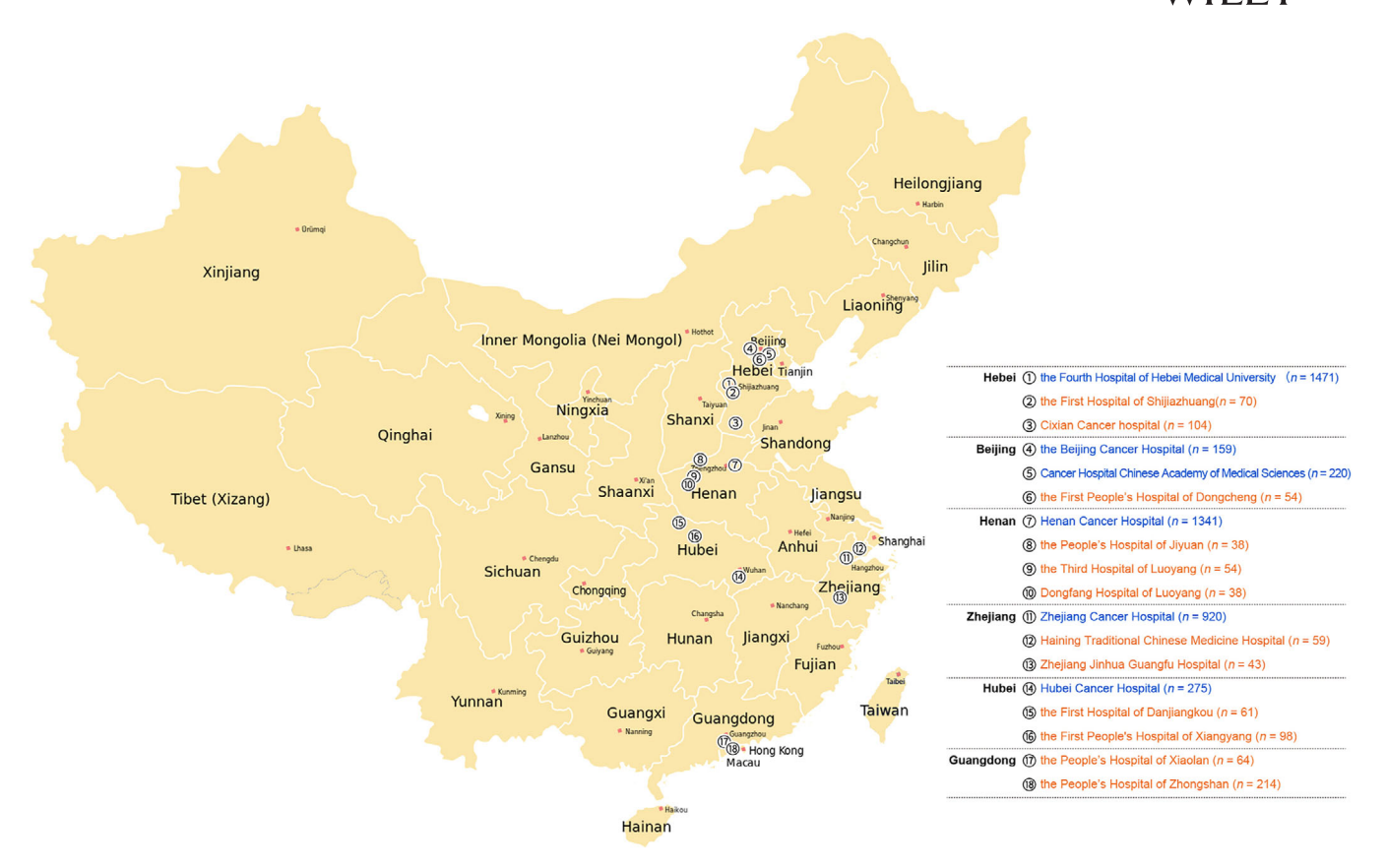
FIGURE 1 Distribution of the participating hospitals comprising of provincial (blue color), and municipal and county (orange color) hospitals

Therefore, the aim of this study was to use a large number of multicenter cases to determine the lifestyle and clinical risk factors related to the survival of EC patients in China. We believe that our findings could act as a guidance to help concerned authorities to improve the management of EC patients.